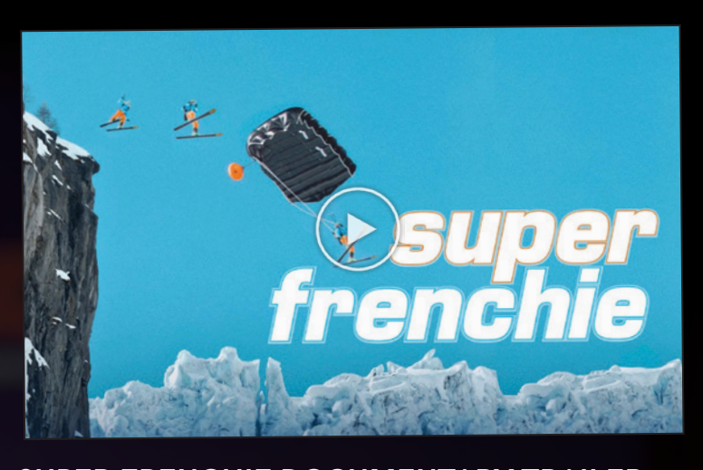
SUPER FRENCHIE DOCUMENTARY TRAILER