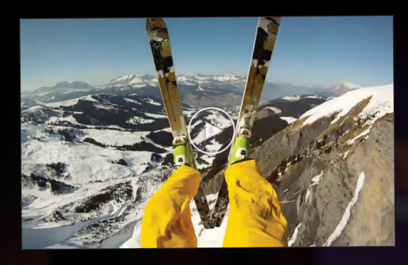
AVALANCH CLIFF JUMP